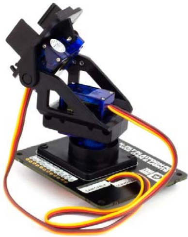
Full kit PIM183